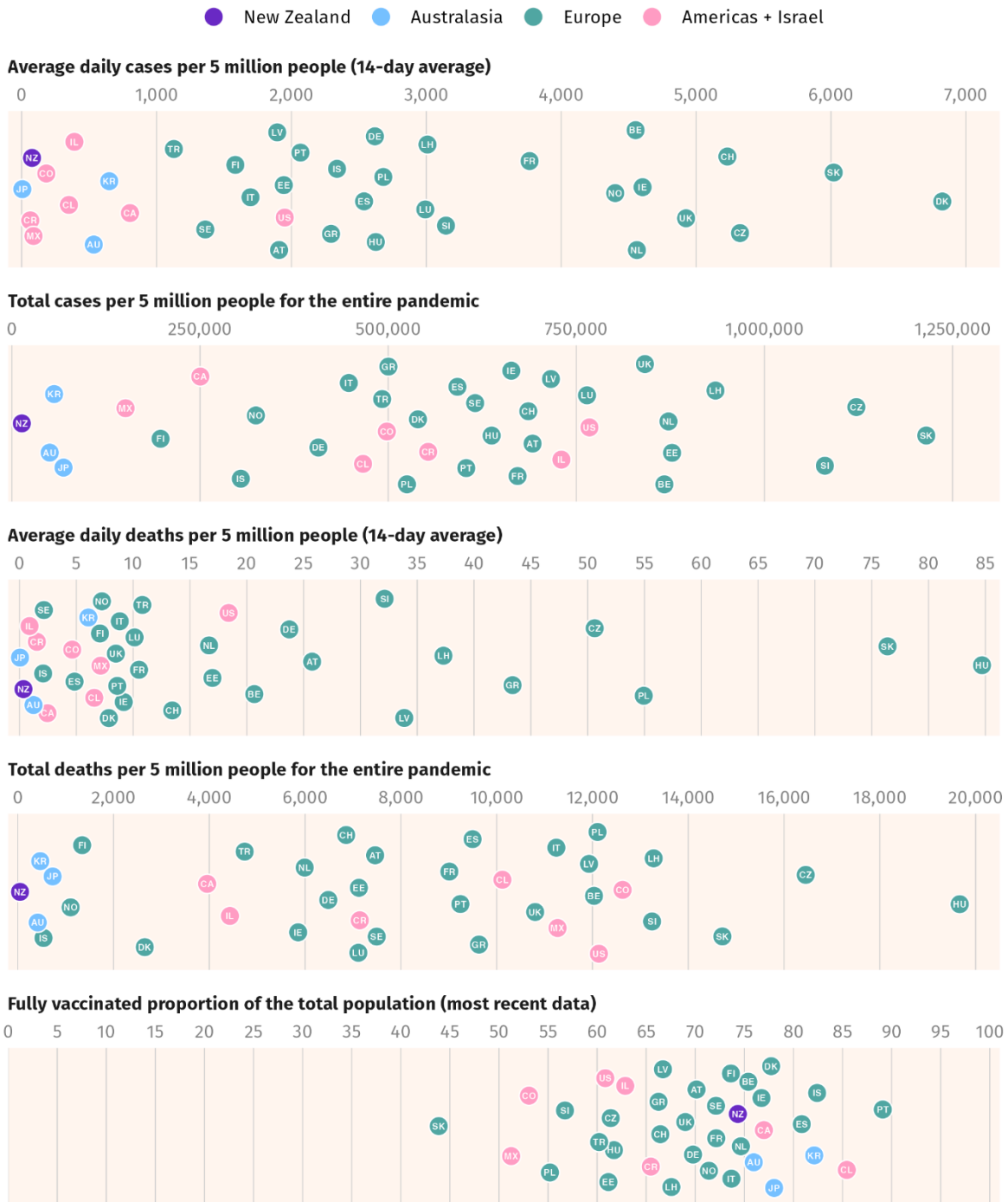
Figure 2: COVID-related cases and deaths, NZ and other OECD countries, 20 December 2021 5

AT: Austria, AU: Australia, BE: Belgium, CA: Canada, CH: Switzerland, CL: Chile, CO: Colombia, CR: Costa Rica CZ: Czechia, DE: Germany, DK: Denmark, EE: Estonia, ES: Spain, FI: Finland, FR: France, GR: Greece HU: Hungary, IE: Ireland, IL: Israel, IS: Iceland, IT: Italy, JP: Japan, KR: South Korea, LH: Lithuania LU: Luxembourg, LV: Latvia, MX: Mexico, NL: Netherlands, NO: Norway, NZ: New Zealand, PL: Poland, PT: Portugal SE: Sweden, SI: Slovenia, SK: Slovakia, TR: Turkey, UK: United Kingdom, US: United States